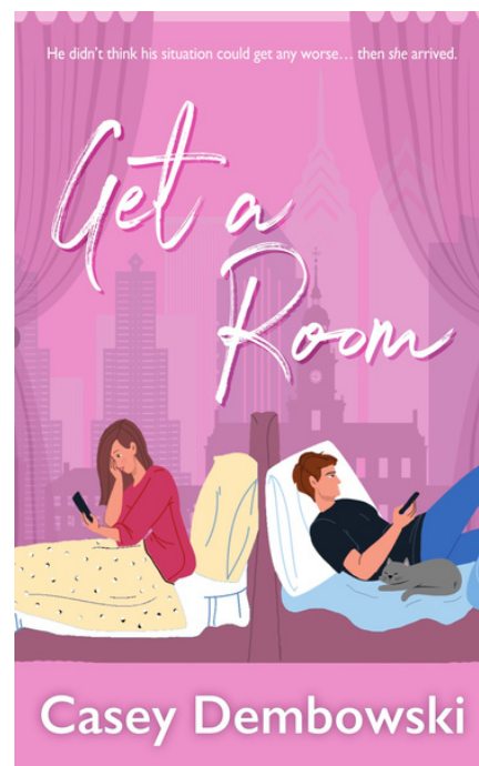
Get a Room July 2023