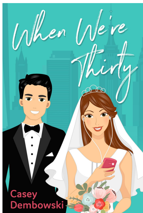
When We're Thirty April 2021